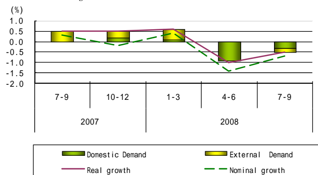
Quarterly Estimates of GDP (The 2nd Preliminary Estimates) Growth rate of GDP from the previous Quarters Contribution of Domestic Demand and External Demand to Changes in GDP

Of real GDP growth rate, -0.3% was contributed by domestic demand and -0.2% by external demand.