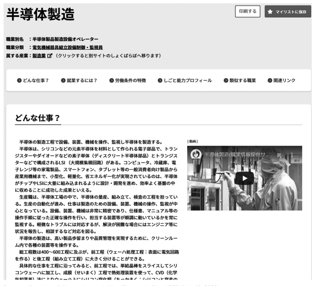
Sample page for "Semiconductor Processors": Text-based description and other information