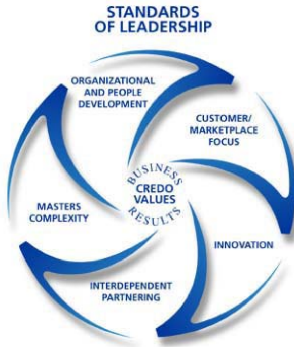
Figure 9 : Standards of Leadership