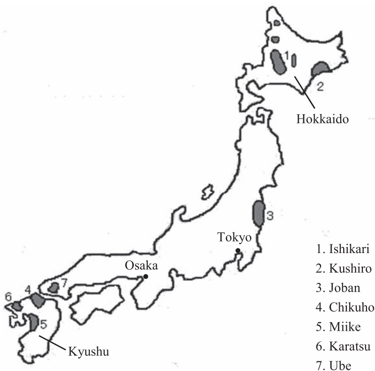
Figure 2. Major Coalfields and Major Cities in Japan