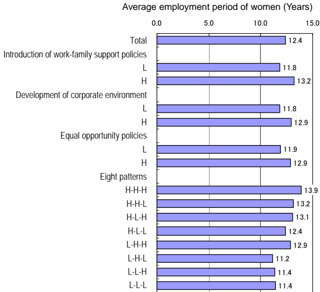
Figure 3. Comparison chart: Average employment period for women

The average employment period for women is longer in corporations with higher “work-family support policies” (significant at the 10% level), “development of the corporate environment,” and “equal opportunity policies” indicators than those with lower figures. Among the eight patterns, H-H-H has the longest employment period, followed by H-H-L. In general, there is a strong link to introducing work-family support policies. Results of the quantitative analysis show a significant positive coefficient (at the 10% level) in the H-H-L pattern, indicating that improving work-family support policies has an effect on retention (Results of the analysis are abbreviated).