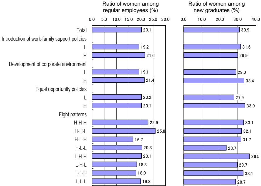
Figure 2. Comparison chart: Average ratios of women among regular employees and new graduates

the past three years” classified by the above types of corporations.