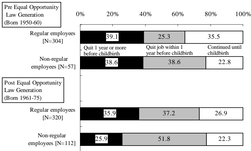
Figure 3. Time to leave job for first childbirth and job continuation until childbirth (type of employment*, for each cohort)

* Type of employment before the first childbirth.